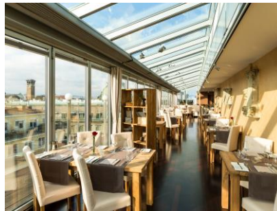
← Hotel Royal